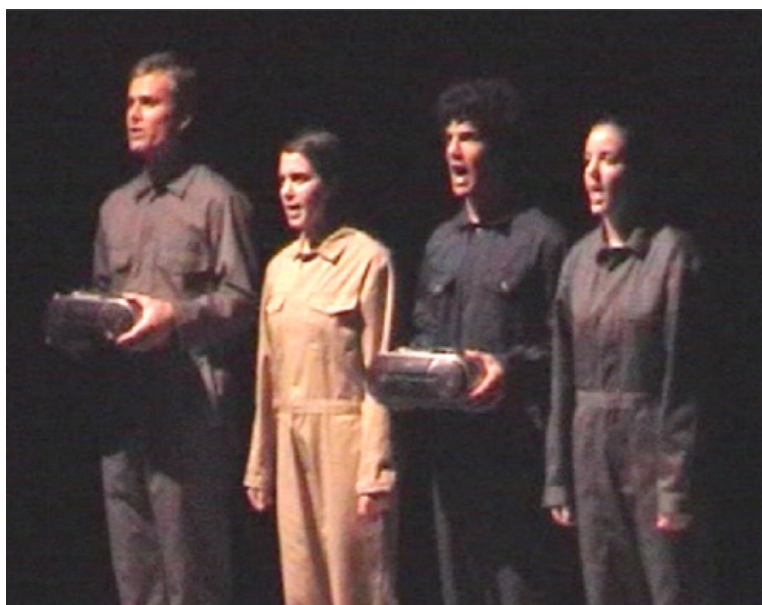
Figure 2. Performers delivering speech and holding mobile sound sources during a performance of To have done with the judgment of Artaud at the Northern School of Contemporary Dance in Leeds, England.

The third relationship investigated in the piece was the one between the performers' voices and the transformed sounds. This relation was established using mobile sound sources that the performers carried with them in different sections of the piece, as will be explained in detail in the following section.